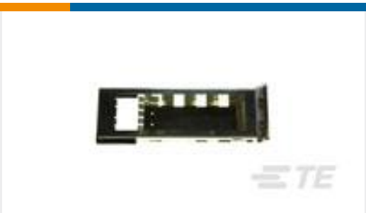
TE Part #1489951-1 XFP CAGE ASSEMBLY