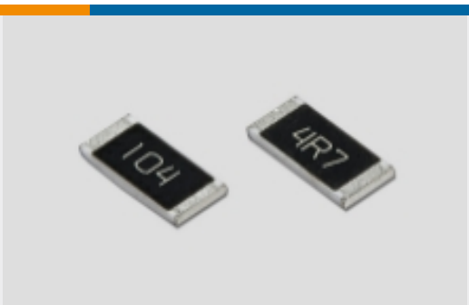
Surface Mount Resistors(554)