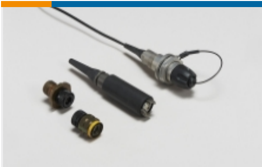
Expanded Beam Fiber Optics(9)