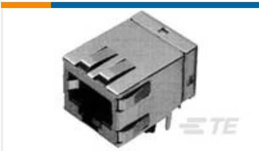
TE Part #5406299-1 MJ ASSY,S/P,8POS,SH,RVPGT,CAT 5e