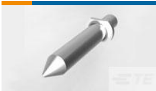
TE Part #223956-1 STV ERMZUB FUEHRUNGSBOLZEN J *M 1 ***