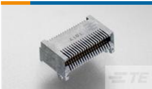
TE Part #2110819-1 QSFP+ Enh EVERCLEAR PT Conn