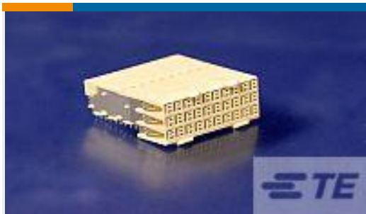
TE Part #6469081-1 HMZD 3PR, RECEPTACLE ASSEMBLY