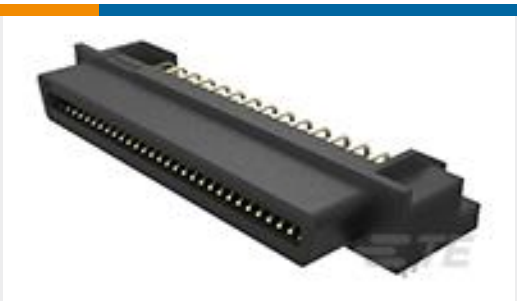
TE Part #1-1734037-0 Champ 050 series 100pos,Au over PdNi