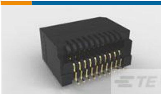
TE Part #1367073-2 20 POS SMT CONN, SFP, 30AU