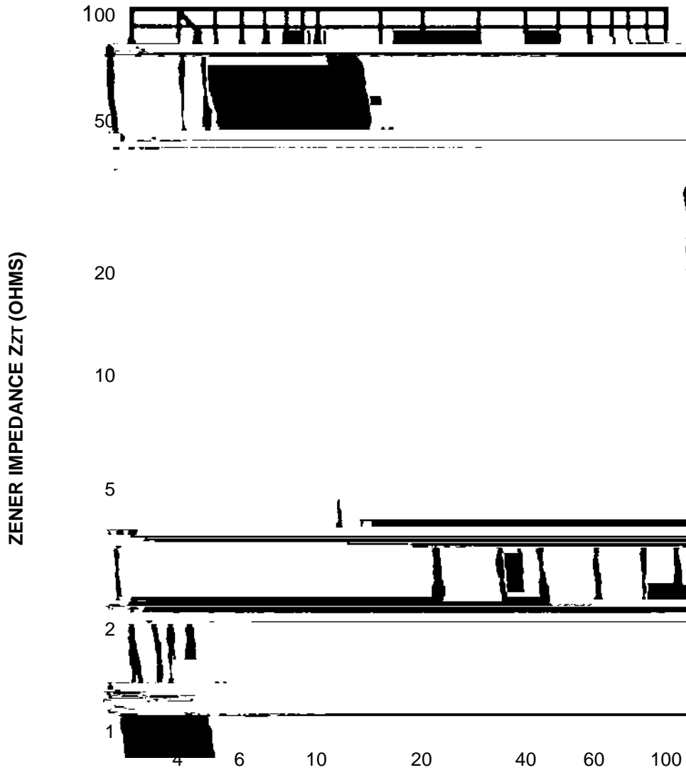
FIGURE 3 operating current (mA)