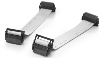
With optional strain relief